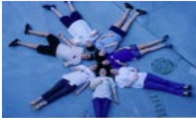
TSA members put their heads together.