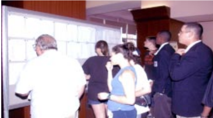
Maybe yes! Maybe no! Each conference day, TSA members check out competition results to see how they have done.