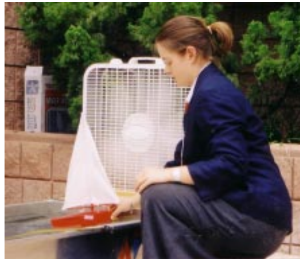
Every sailboat needs a stiff wind, especially in a TSA competition.