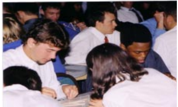
Building bridges, one step at a time. Students prepare their on-site projects for their competition in a timed, classroom setting.