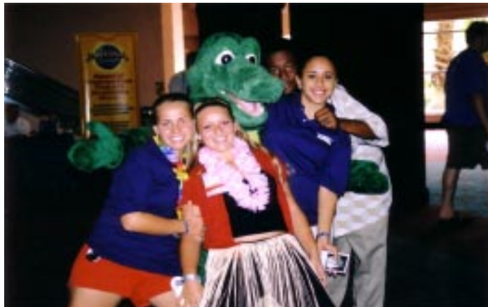
These TSA members knew there are alligators in Florida, but can this one please join their TSA team?