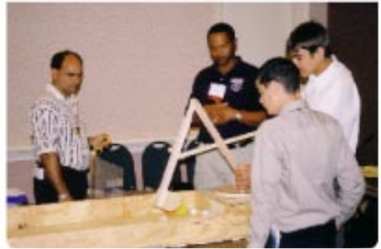
Racing the clock. Students scoop up items during this competition as advisors time progress.