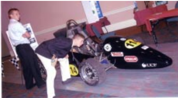
Vrroom, Vroom, So where are the keys, this TSA member wonders?